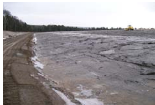
The Superior Community!